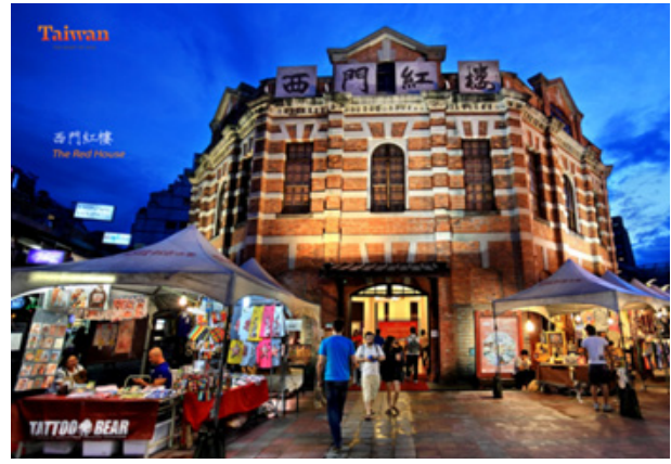
A historic market place in downtown Taipei