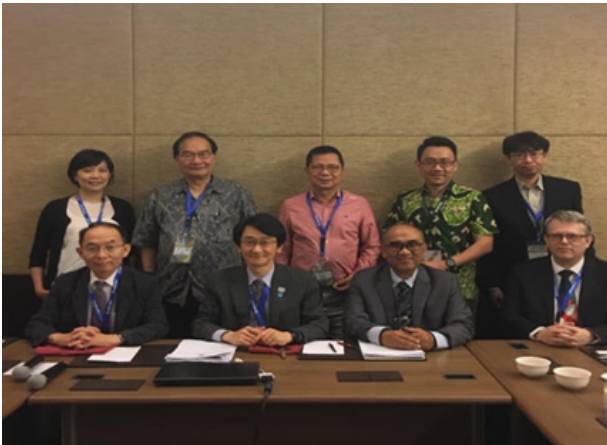
A photo taken after the council meeting of Asian College of Neuropsychopharmacology

in exchanging and to promoting our innovative knowledge in the neuropsychopharmacology field among of all attendances especially members of colleges. Following the great success of the AsCNP-ASEAN 2019 International Congress, we hope that we can reach out the new insights towards understanding in neuropsychopharmacology field in South-East Asia. (The author declares no conflicts of interest in writing this feature.)