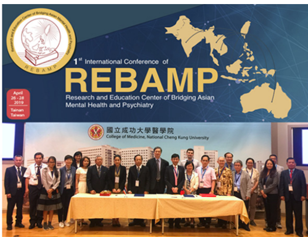
A group photo of delegates of the first IC of REBAMP at National Cheng Kung University, Tainan, Taiwan.

All participants showed the passion of international interaction and it will be a wonderful academic collaboration through the REBAMP in the future. (The authors report no conflicts of interest.)