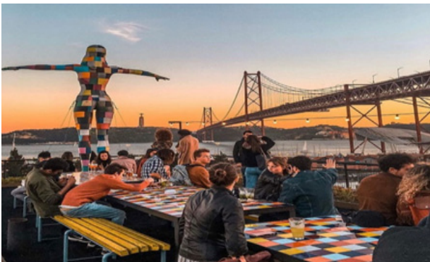
Lisbon's thriving social life, overlooking River Tejo

Taking place in the summer, in one of the most astounding and heart-warming countries in Europe and granting a programme filled with valuable knowledge and contributions from the best in the field, this year's WCP will surely be an event to attend. (The authors declare no conflicts of interest.)