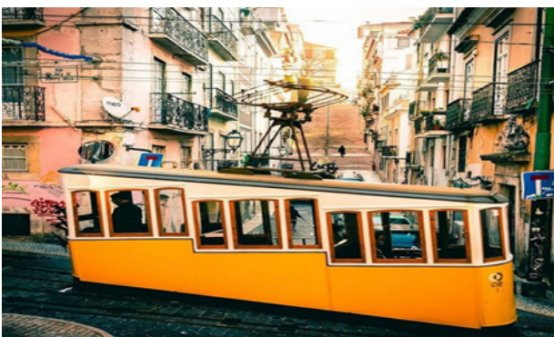
A traditional Lisbon tram