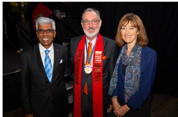
A photo from RANZCP Congress, May 2019.

We invite you to join us at next year's Congress with a theme of ‘Influencing and being influenced by the world around us’. Save the date for 17–21 May 2020, in Hobart, Australia. (The author declares no conflicts of interest.)