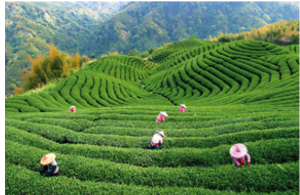
Tea garden in Srimongal

Please join the 10th ICP for an exciting and learning experience in December 2019 in Srimongal, Bangladesh. (The author declares no potential conflicts of interest besides promoting the attendance.)