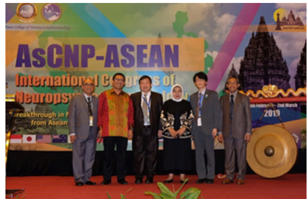
A photo taken at the opening ceremony

The Bulletin of the AFPA © 2019 The Asian Federation of Psychiatric Associations®