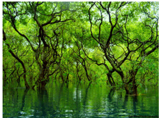
Ratargul swamp forest in Sylhet