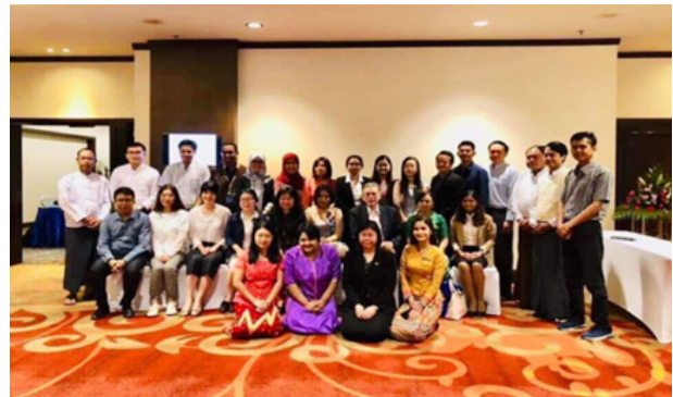
Photo 1. A group photo of pre-congress workshop on leadership and professional development training, 25 October, 2018)

(2), and India (1). Out of total 26 participants, 17 psychiatrists were from the host country, Myanmar.