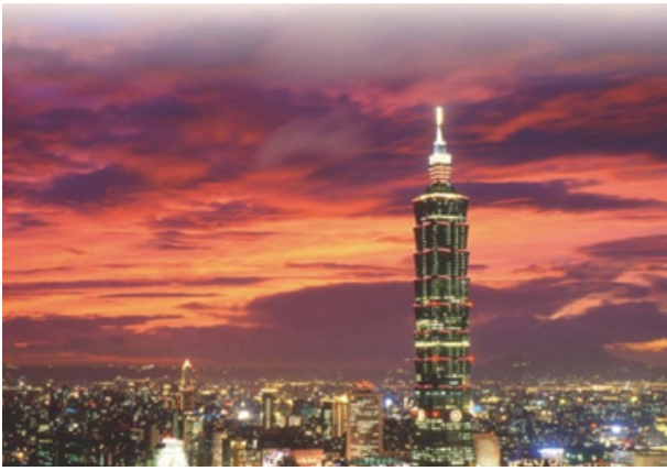
Taipei 101, used to be the highest building in the world