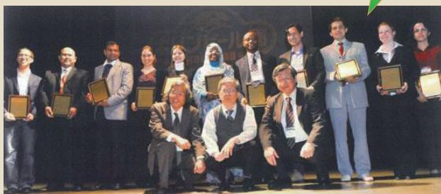
【108th Annual Meeting】 Scene of Award Ceremony