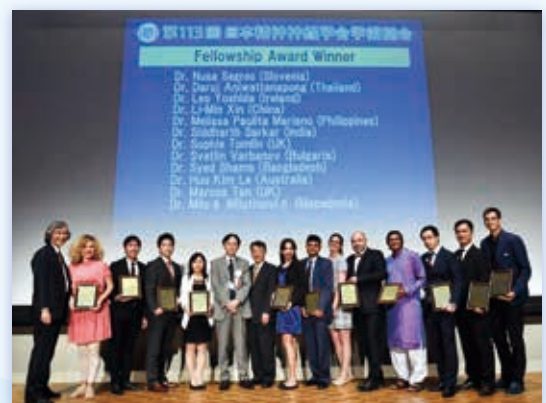
Fellowship Award ceremony in 2017 ▶